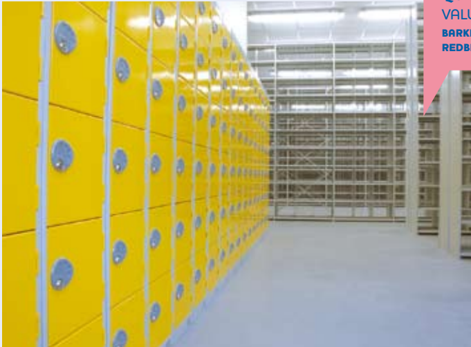
QUEEN'S HOSPITAL VALUE £2.2M BARKING, HAVERING & REDBRIDGE NHS TRUST

This major scheme comprised the internal refurbishment of an existing industrial unit to create mezzanine floor, offices and extensive medical records storage facilities for Queen's Hospital. Work included the completion of a new roof, an extensive mechanical and electrical installation and the provision of specialist medical racking at this state-of-the-art facility, accommodating around 70 staff.