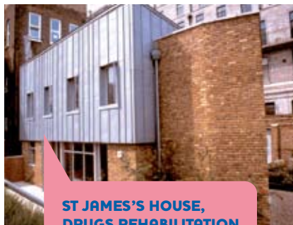
ST JAMES'S HOUSE, DRUGS REHABILITATION CENTRE VALUE £693K CAMDEN & ISLINGTON NHS TRUST

This former Victorian Nursing Home was sympathetically converted into a Drugs Rehabilitation Centre, including the fast-track completion of a 2-storey extension for people requiring secure care and assistance.