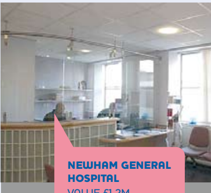
NEWHAM GENERAL HOSPITAL VALUE £1.2M NEWHAM HEALTHCARE NHS TRUST

This major scheme comprised the internal refurbishment of an existing industrial unit to create mezzanine floor, offices and extensive medical records storage facilities for Queen's Hospital. Work included the completion of a new roof, an extensive mechanical and electrical installation and the provision of specialist medical racking at this state-of-the-art facility, accommodating around 70 staff.