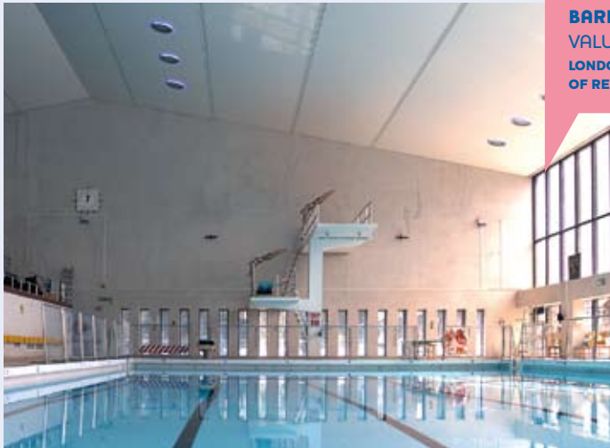
FULLWELL CROSS LEISURE CENTRE, BARKINGSIDE VALUE £1.6M LONDON BOROUGH OF REDBRIDGE

Lakehouse was responsible for the major refurbishment of these facilities, including a 25 metre pool, teaching pool, fitness studio and vapour health suite, providing the local community with an improved range of fitness activities. The transformation marked the beginning of a new era for the baths, with its new water filtration system and brand new coating.