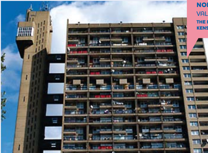
TRELICK TOWER, NORTH KENSINGTON VALUE £588K THE ROYAL BOROUGH OF KENSINGTON AND CHELSEA

This Grade II 31-storey London landmark required structural reinforcement of three basement levels as a result of changes in factors of safety. 20 flats were decanted to allow for the installation of reinforced steel frameworks and subsequent concreting of shear walls to strengthen this 120 metre tall building.