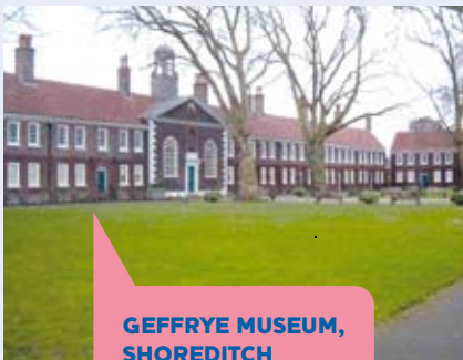
GEFFRYE MUSEUM, SHOREDITCH VALUE £326K THE GEFFRYE MUSEUM TRUST LIMITED

This Grade II 31-storey London landmark required structural reinforcement of three basement levels as a result of changes in factors of safety. 20 flats were decanted to allow for the installation of reinforced steel frameworks and subsequent concreting of shear walls to strengthen this 120 metre tall building.