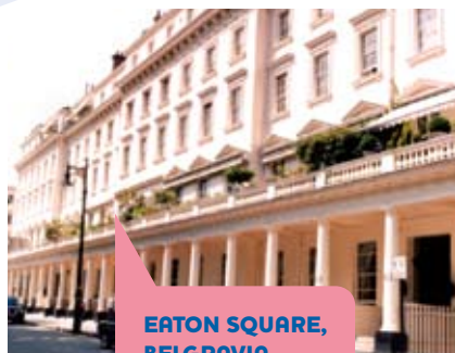
EATON SQUARE, BELGRAVIA VALUE £500K GROSVENOR ESTATES

Works to this Grade II listed classical building comprised stucco repairs, masonry repairs, timber repair and replacement, roofing repairs, railing refurbishment and external decorations.